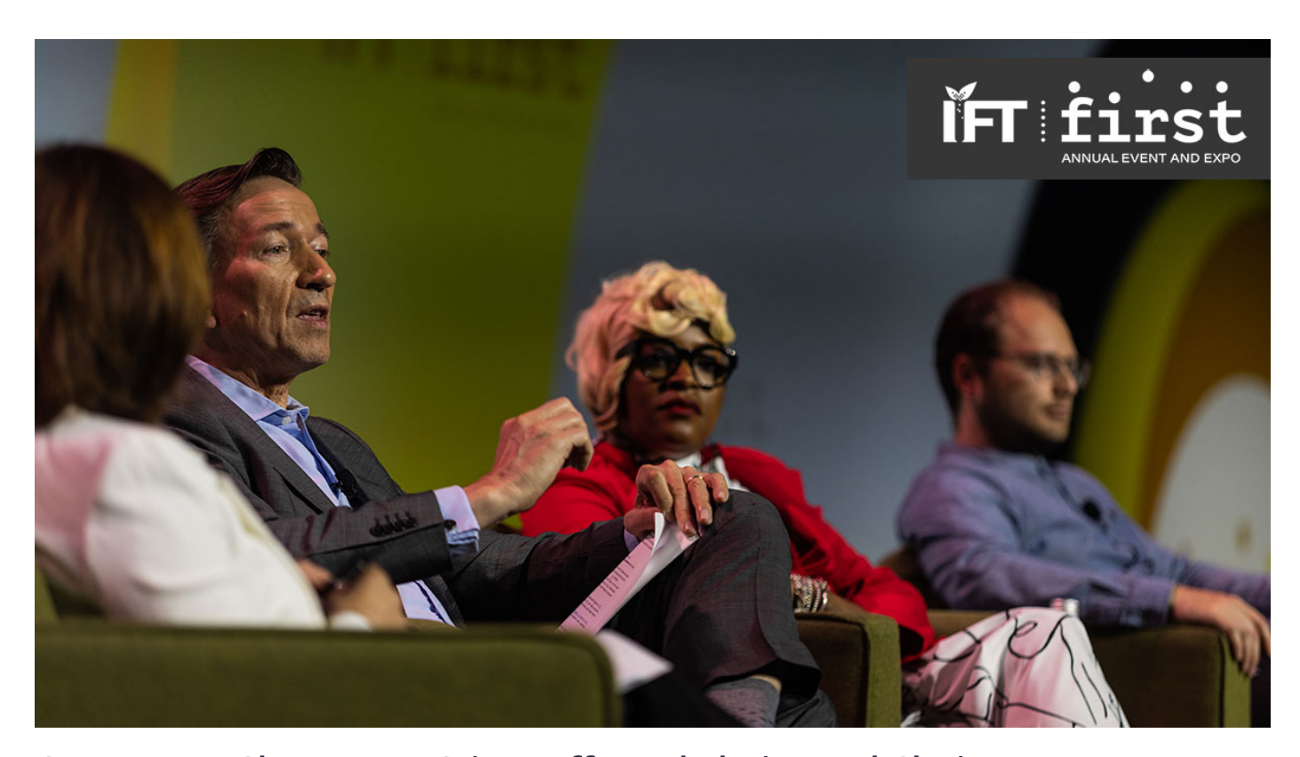
Consumers Share How Crises Affected Their Food Choices

Strong sales are forecast for companies that keep it healthy, fresh, and affordable as well as convenient.