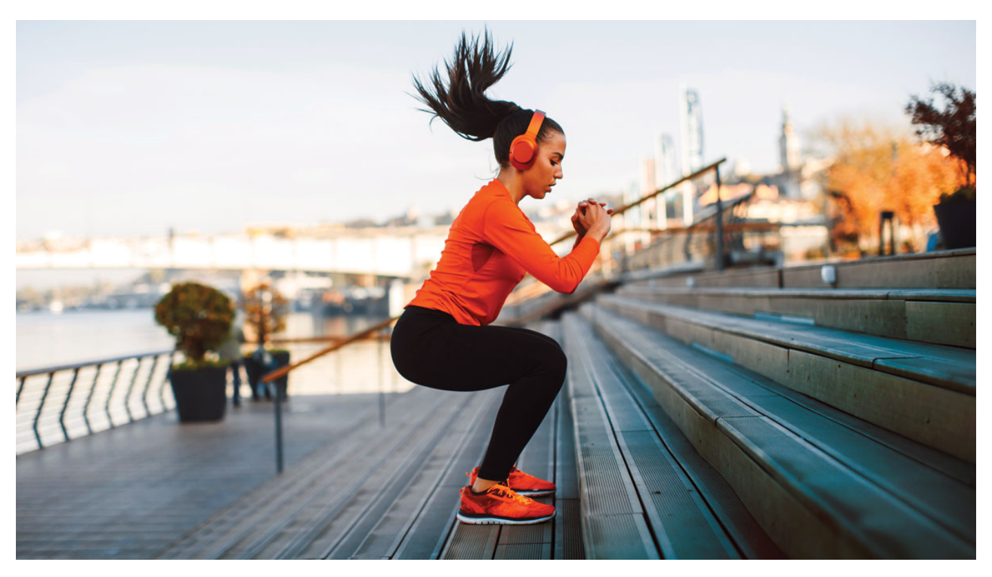
Strong and Balanced Food for Women

Sharing their personal stories, a panel of three consumers addressed how their food choices were and are impacted by crisis at a Tuesday IFT FIRST featured session.