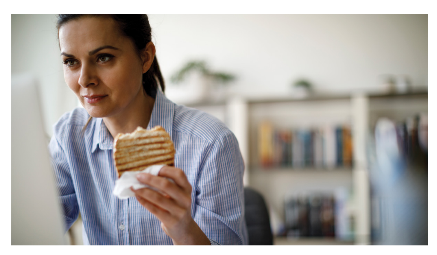
The Top 10 Food Trends of 2023

The science of food is ever-changing to reflect the latest scientific research in nutrition and food safety, evolving consumer preferences and behaviors, shifts in the regulatory and legislative landscape, and innovations in new product development. Below is a curated collection of IFT's coverage of leading trends for 2023.