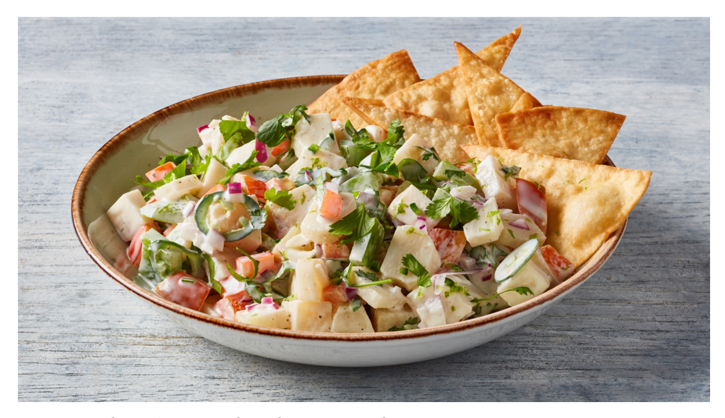
2023 Foodservice: Food & Flavor Trends

IFT's Science and Policy team has connected the dots from processed foods and global food system silos to food safety hazards, supply chain constraints, sustainability efforts, and more.