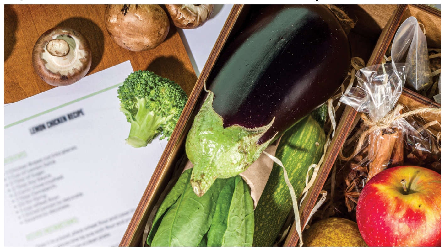
What's on the Menu for Meal Kits?

Strong sales are forecast for companies that keep it healthy, fresh, and affordable as well as convenient.