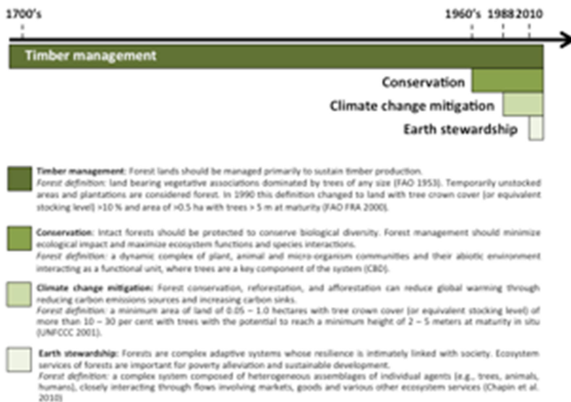
Fig. 2 Forest definitions emerge from prevailing objectives of use and management. Since the mid-twentieth century, forest management objectives and definitions have diversified, with new ones being added to earlier more entrenched and legitimized ones. Similarly, forest management policies have broadened their objectives, focusing not only on sustainable timber production, but gradually incorporating non-timber forest products, biodiversity conservation values, ecosystem services delivery, human well-being, landscape approaches, adaptive management, and socio-ecological resilience

Environmental movements arising in the 1960s generated new forest management objectives based on the ecological concept of forest as natural ecosystems (Figs. 1, 2), mobilizing individuals and newly formed national and international organizations to conserve nature and halt