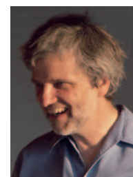
Ortwin Renn is Director of the Department of Technology and Environmental Sociology at the University of Stuttgart, Germany. E-mail: ortwin.renn@sowi.uni-stuttgart.de doi:10.1038/sj.embor.7400950