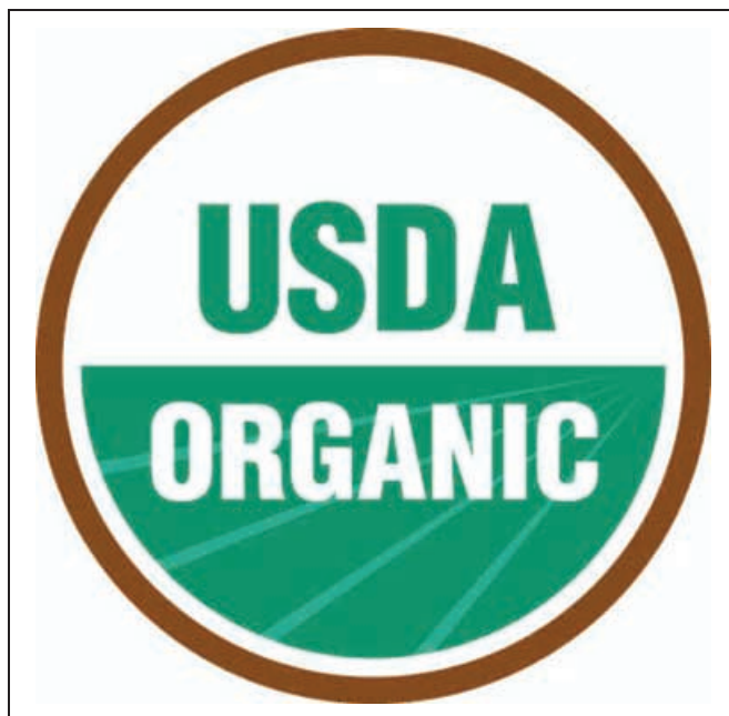
Figure 3—The USDA organic seal