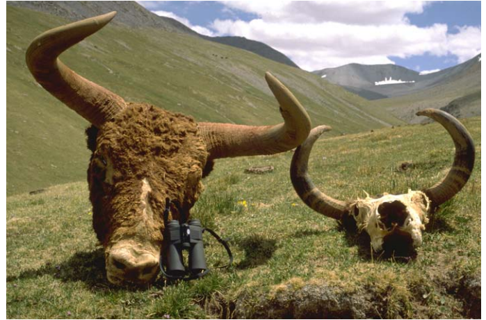
Fig. 3. —Skulls of male (left) and female (right) wild yaks ( Bos mutus ) from Yeniugou, central Qinghai, China, highlighting relative mass and sexual dimorphism in skull size and horn shape.

Relative to mass, a small female wild yak may be only one-third the size of a large male; in contrast, female domestic yaks are 25–50% smaller (Harris 2008; Miller et al. 1994; Wiener et al. 2003). Body mass (kg) of adult male wild yaks has been estimated at >800 kg (Engelmann 1938) and as high as 1,000 kg (Schäfer 1937; Wiener et al. 2003:43) and 1,200 kg (Lu 2000; Lu and Li 1994); females are about